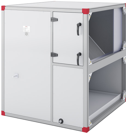
Plate heat exchanger (code EXP)

The EXP plate heat exchanger is a complete unit with a plate exchanger which uses heat transfer according to the air-air principle.