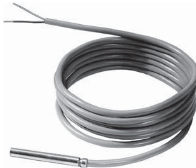
QAZ21.. and QAZ36..